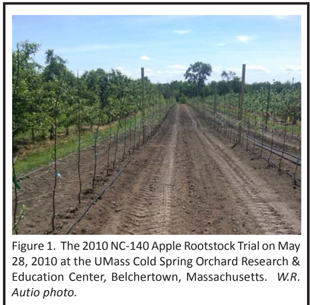
Figure 1. The 2010 NC-140 Apple Rootstock Trial on May 28, 2010 at the UMass Cold Spring Orchard Research & Education Center, Belchertown, Massachusetts.

In 2010, a new apple rootstock trial was established by the NC-140 Rootstock Research Committee at 20 sites in the United States, one in Canada, and one in Mexico. Varieties include Honeycrisp in 15 northern locations and Fuji in seven southern locations. In Massachusetts (UMass Cold Spring Orchard Research and Education Center, Belchertown, MA, Figure 1) and