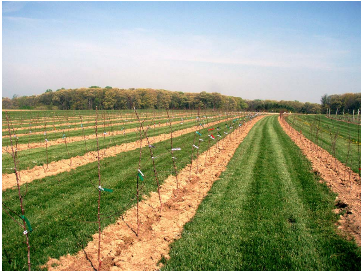
Figure 2. The 2010 NC-140 Apple Rootstock Trial on April 22, 2010, immediately after planting, at Rutgers Clifford E. and Melda C. Snyder Research and Extension Farm, Pittstown, New Jersey. Turf was established during the summer of 2009 with Turf Type tall fescue planted at 300 pounds per acre. In the spring of 2010, contour rows were laid out and herbicide strips were killed with Roundup. After planting, strips were sprayed Galery, Prowl H2O, and Solubor.