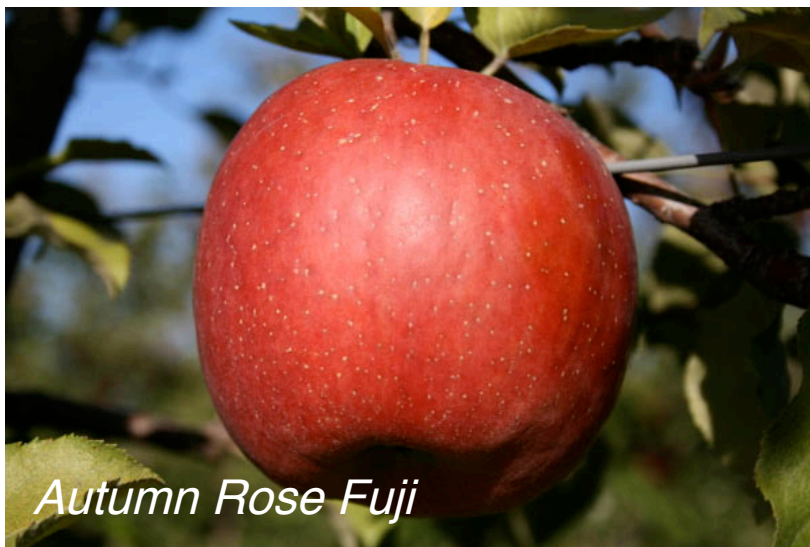
Autumn Rose Fuji