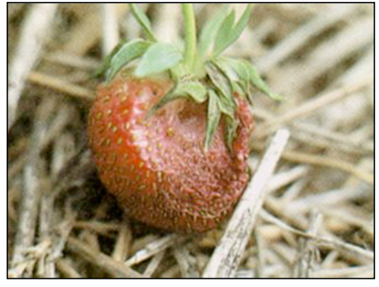
Figure 1. Sunscald.

The very warm weather is favourable for the development of anthracnose fruit rot. The spores of this disease can multiply and spread throughout the field without infecting the fruit. If we get rain, or especially heavy splashing rain, after this warm week of weather, there is a good chance that anthracnose fruit rot will show up. Cabrio EG fungicide is a new product for strawberries, and is very effective for anthracnose control. It is a good choice at the green fruit stage where there has been a history of problems with this disease, or when conditions are extremely favourable. Cabrio has a preharvest interval of one day. ( Source: The Ontario Berry Bulletin, June 27, 2003 )