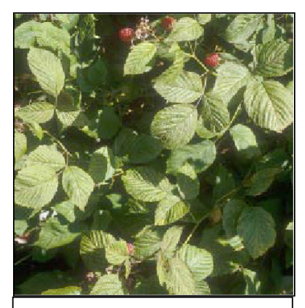
Figure 3. Buildup of late season yellow spider mite populations during harvest.

mite its name (Figure 4). All life stages spin а continuous thread silk of called webbing over the foliage they have colonized (Figure 5). Spinning of the webbing plays a role in spider mite dispersal, migration, and deposition of eggs. The webbing protects the spider from mites predators, pesticides, and