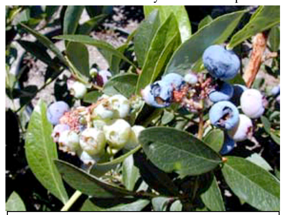
Figure 1. CBFW cluster infestation and pre-maturely ripened fruit.

fruit. Therefore, once it is inside the fruit there is very little opportunity for control. This is not the case for CBFW. As the CBFW larva grows, it moves from the initially infested fruit to another and another, tying the cluster together into a messy mass of webbing, berries, and frass. Therefore, even if you could not prevent the initial infestation, every time