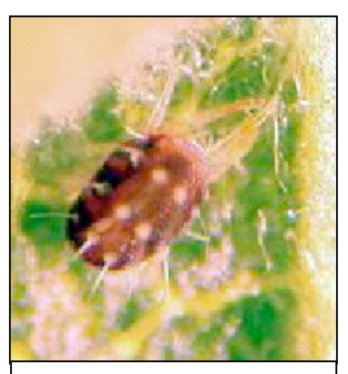
Figure 8. Adult female European red mite.

common to all spider mite species pierce and suck plant juices. This type of feeding activity produces small, yellowish spots on the upper leaf surface. Leaf margins appear dried and turn reddish brown. Generally five to six overlapping generations occur per year in western Washington. Summer females each lay about 130 eggs during a 30-day life span on red raspberry. Field populations increase rapidly after harvest through early September. They can cause extensive bronzing, drying, withering, and defoliation of primocane foliage by late August. Leaf quality declines in response to cooler fall temperatures, shorter day length, and spider mite feeding. Spider mite females change to orange overwintering forms and begin to migrate from the leaves to overwintering sites.