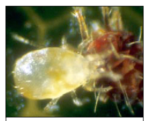
Figure 12. Several predatory mites, such as Neoseiulus fallacis , are important natural enemies of spider mites on red raspberry.

Good integrated mite management builds on cultural practices. Integrated management practices that reduce dust on foliage and fruit minimize harmful effects to arthropod predators and potential for severe spider mite outbreaks (Figure 13). Good farming practices improve the health and vigor of the plant to better withstand mite feeding impacts. Good practices do not guarantee supplemental chemical control will not be needed either before or after harvest. Newer miticides are more selective for the spider mite pests and safer to predatory mites. Good farming practices in orchard integrated control of spider mites can incrementally shift an orchard away from a miticide-based program. ( Source: Excerpted from Washington State University Extension Bulletin 1959E )