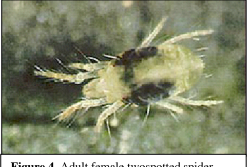
Figure 4. Adult female twospotted spider mite.

water loss. The twospotted spider mites overwinter as orange-colored adult females within the soil, in basal fruiting canes, and plant debris. They commonly emerge from April to May and begin to feed on older or mid-shoot leaves on fruiting canes before dispersing to the upper canopy in July to August. As these overwintering females feed they take on the species' normal yellow-green hue and two characteristic darkcolored food spots. The stylet shaped mouthparts