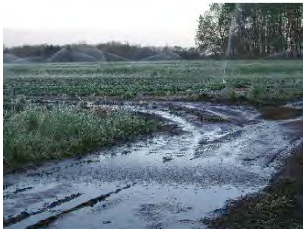
Figure 7a: Standing water and water-saturated soil in a strawberry field

Figures 6a, 6b: Splashing water can spread diseases like angular leaf spot and anthracnose fruit rot