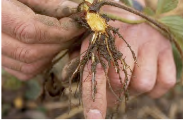
Figure 7b: Water-saturated soils favour root diseases such as red stele.

Disease and fungus can be limited by reducing the water applied. Water volumes can be reduced by: