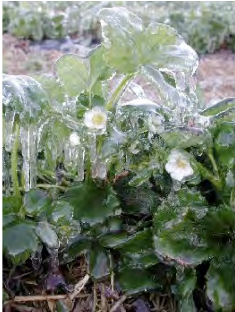
Figure 5: Strawberry bloom coated in clear ice