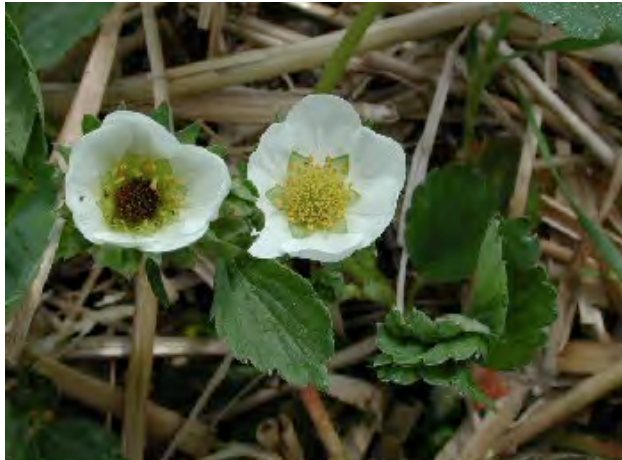
Figure 1: Frost-injured strawberry bloom