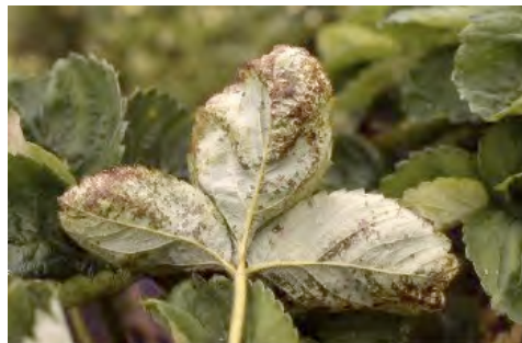
Figure 6a: Angular leaf spot

Root rots, such as red stele, thrive in saturated soil conditions. Outbreaks of red stele and other root rots have occurred after long periods of irrigation for frost protection. The sites most suited for frost protection by irrigation are well drained sites with sand or sandy loam soils.