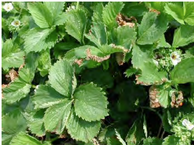
Figure 3: Frost injury on strawberry leaves

Frost usually damages the biggest and earliest bloom. This represents the best and most lucrative part of the berry crop, because prices are highest at the beginning of the season. Further, the first flowers to open produce the largest fruit. If 5 percent to 7 percent of the flowers are lost, and these flowers are mostly king bloom, the total crop will be reduced by 10 to 15 percent.