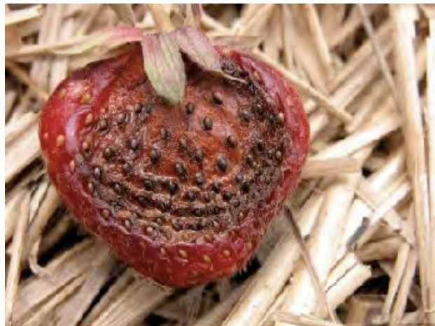
Figure 6b: Anthracnose fruit rot

Figures 6a, 6b: Splashing water can spread diseases like angular leaf spot and anthracnose fruit rot