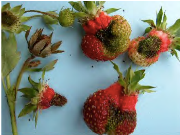
Figure 2: Misshapen berries resulting from blooms which are partially damaged by frost