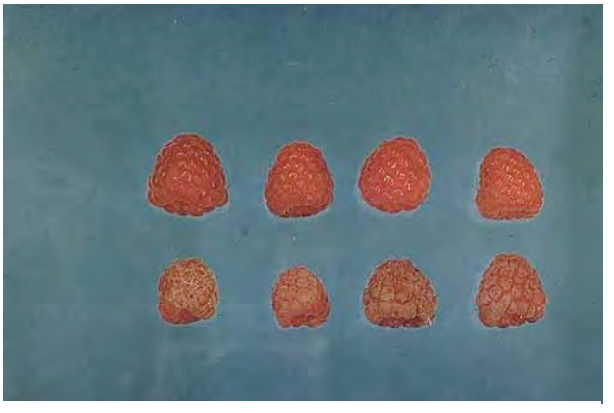
Powdery mildew on raspberry fruit, Note the lower row of berries are smaller with a dull appearance.