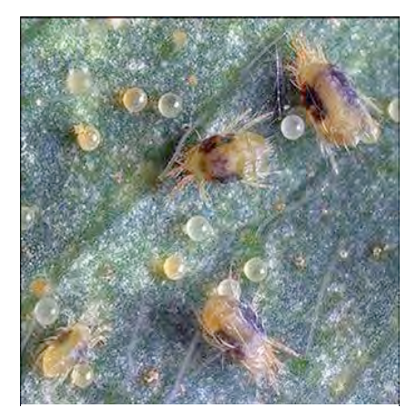
Figure 1: Two-spotted spider mite adults and eggs.

Damage first appears as flecking and stippling on the leaves. Because the mites overwinter near the base of the plant, older leaves closest to the ground are affected first. As populations build and leaves age or become damaged, mites move up the plant to newer, more succulent growth. Extensive feeding by mites causes leaves to turn yellowish or bronzed, and eventually dry and brittle. Fine webbing is evident on the lower leaf surface when populations are high.