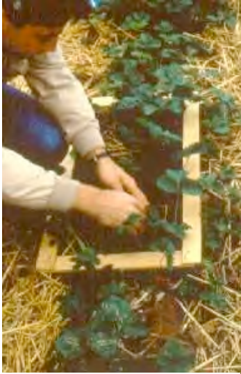
Figure 1. Monitoring for strawberry clipper weevil in strawberry plants.