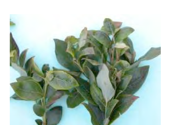
Figure 2: Symptoms of blueberry stunt include shortened internodes and a bushy appearance to shoots.

Infected plants become stunted (Figure 1, 2), and new leaves are cupped under, small and yellowed at the edges (Figure 3). Sometimes infected bushes show a characteristic bright red colouring on leaves of certain shoots (Figure 4). Control of blueberry stunt is drastic: you must remove infected bushes. ( Source: The Ontario Berry Grower, Sept. 1, 2005 )