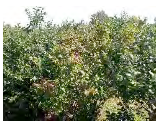
Figure 1: The blueberry bush in the middle is infected with stunt.