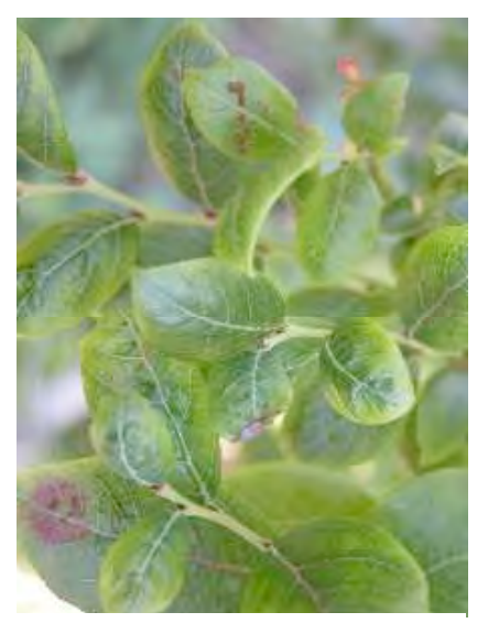
Figure 3: Symptoms of blueberry stunt include downward cupping of leaves and marginal yellowing.