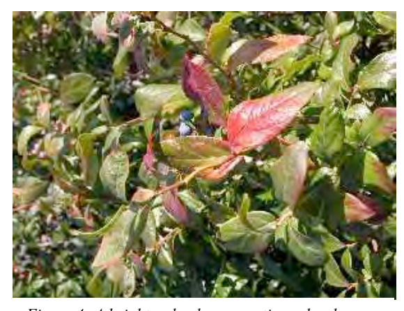
Figure 4: A bright red colour sometimes develops on blueberry shoots infected with stunt.