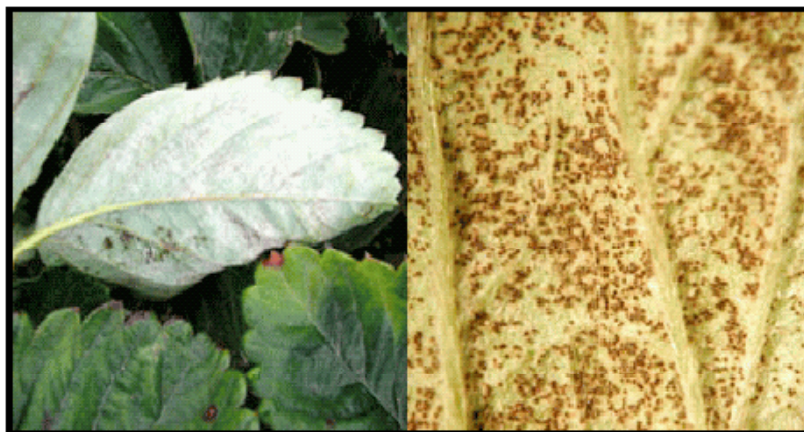
Powdery mildew symptoms on underside of leaf. Fruiting bodies of the fungus can be seen towards the end of the summer (right picture).

Nova 40W be alternated with a tank mix of Topsin- M plus Captan. If anthracnose fruit rot was (or has been) a problem, growers should use a fungicide that also has activity against this disease, such as Captan or Quadris. The fungus is capable of attacking the petioles of young leaves as they emerge after renovation. Fungicide applications at this time serve to protect the leaves from attack and reduce the pathogen population that can overwinter and cause outbreaks next season. Quadris has good activity against anthracnose and powdery mildew. In trials conducted in Ohio, Quadris was shown to have excellent activity against leaf blight as well. Captan will have good to excellent activity against anthracnose as long as coverage is maintained. Fixed copper products are the only real option for managing angular leaf spot. Copper can be applied on 14-21 day schedule, but growers