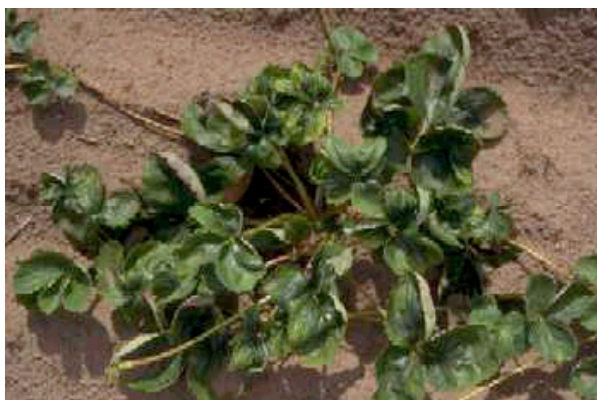
Figure 1: Characteristic leaf yellowing and curling caused by potato leafhopper. similar injury occurs on raspberry.

Leaf tissue analysis is a way of determining the actual nutritional status of plants. It is an excellent and inexpensive way of finding out if your fertilization program is working or if changes need to be made. The analysis provides information on foliar N, P, K, Ca, Mg, Mn, Fe, Cu, B and Zn levels for the leaves sampled and recommendations for corrective measures if needed. Combined with soil testing, leaf tissue analysis can help pinpoint the source of problems and determine what measures may be needed to ensure proper nutrition of the crop. For strawberries sample from the first fully expanded new leaves after renovation. Collect 30 - 50 leaves per sample. Sample different varieties separately, if possible. Collect leaves from as many plants as possible in the sample area.