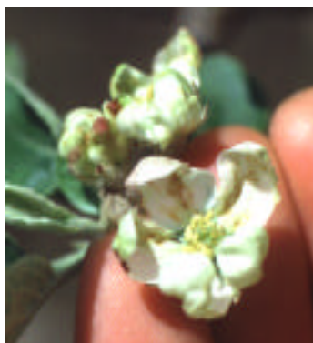
Fig. 48 – Pear thrips damage to apple blossom.