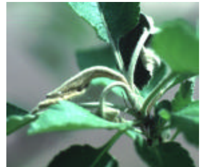
Fig. 46 – Shoot dieback caused by apple pith moth larva feeding.