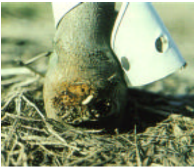
Fig. 41 – Dogwood borer larva in burr knot (13 mm at maturity).