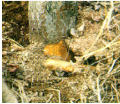
Fig. 42 – Pine vole damage to trunk and roots.