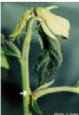
Fig. 47 – Oriental fruit moth damage to terminal. Arrow shows larval entry point.