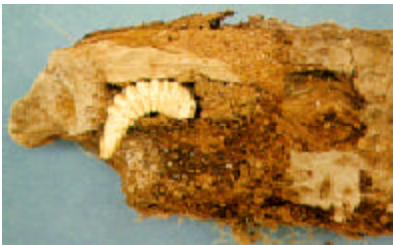
Fig. 44 – Roundheaded apple tree borer (3 – 45 mm as they mature).