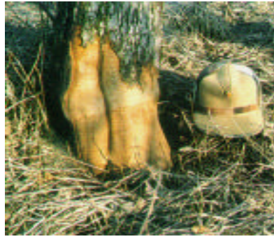
Fig. 39 – Meadow vole damage to trunk..