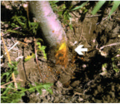
Fig. 38 – Brown decay just below soil line is a common symptom of Phytophthora collar rot .