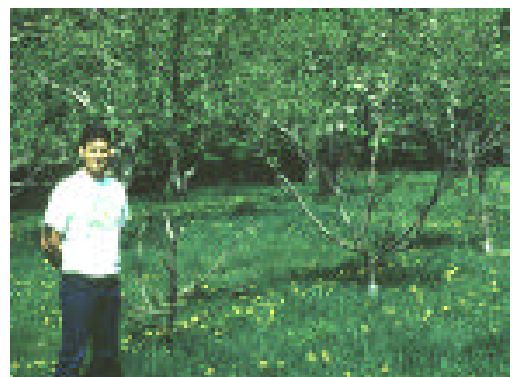
Fig. 49 – Trees with lack of fruiting wood in lower canopy because of repeated deer browsing.