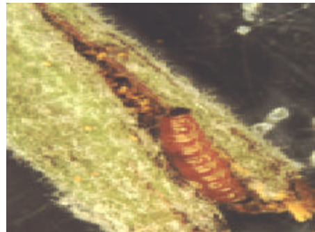
Fig. 45 – Apple pith moth larva in shoot (8–10 mm when full grown).