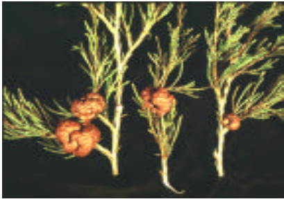
Fig. 29 – Cedar-apple rust galls on required alternate host juniper.