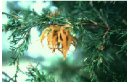
Fig. 30 – Cedar-apple rust galls produce gelatinous spore horns during late-April to early-June rains.