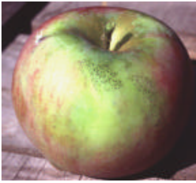
Fig. 26 – Flyspeck fungus.