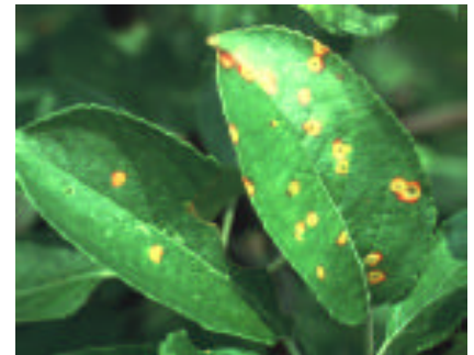
Fig. 31 – Cedar-apple rust leaf spots on apple.