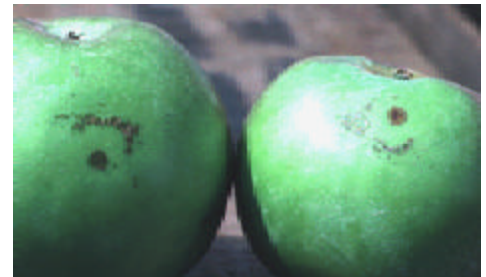
Fig. 34 – Fruit russet attributed to concentrated spray residue.