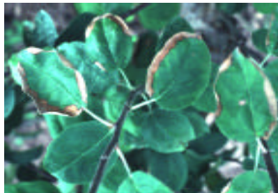
Fig. 33 – Marginal leaf necrosis attributed to calcium spray burn.