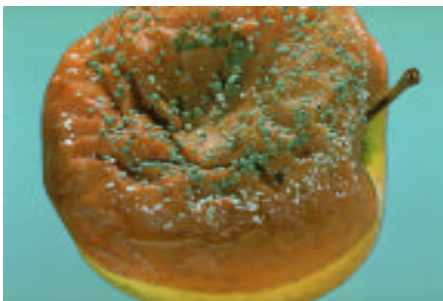
Fig. 35 – Blue mold ( Penicillium spp. ) postharvest storage rot.