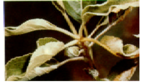
Fig. 28 – Powdery mildews causes white powdery covering on leaves that may also be curled and distorted.