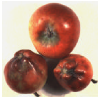
Fig. 32 – Quince rust causes fruit deformation in the calyx end.