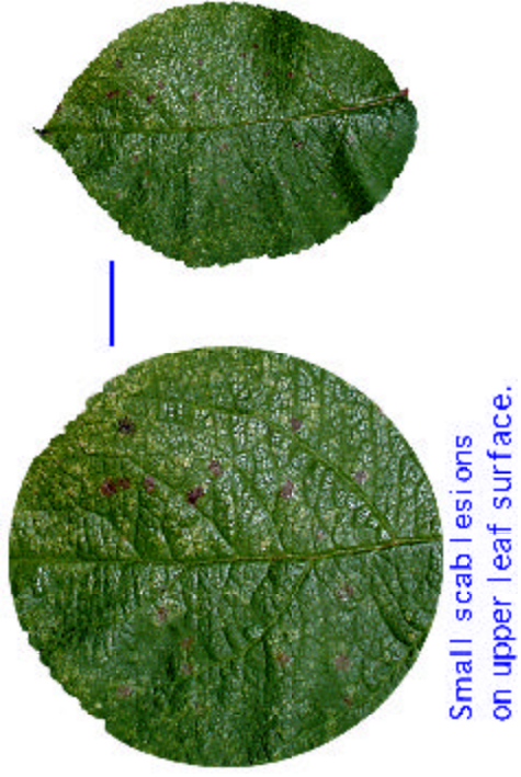
Fig. 11 – Less obvious scab lesions that must also be counted for accurate scab indexing.