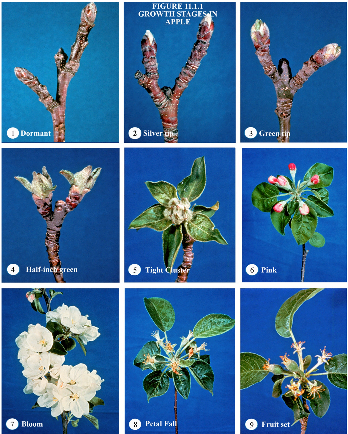
FIGURE 11.1.1 GROWTH STAGES IN APPLE