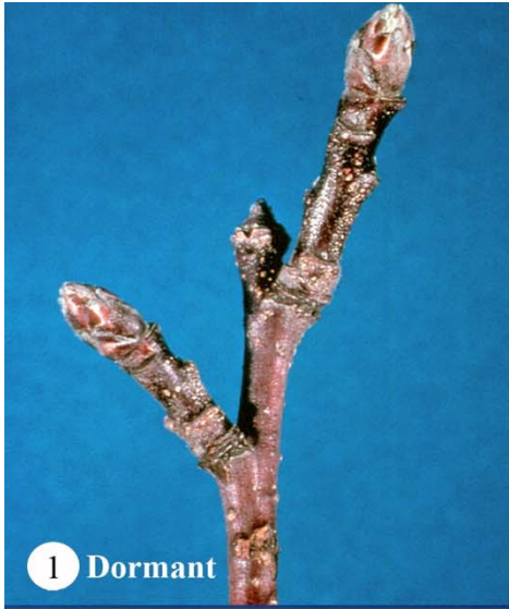
FIGURE 11.1.1 GROWTH STAGES IN APPLE