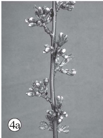
Figure 13.1.1 GROWTH STAGES IN TART CHERRY 1. Dormant 2. Swollen Bud 3. Bud Burst 4a. Early white bud 4b. White bud 5. Bloom 6. Petal fall 7. Fruit set